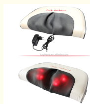
Massage Any Tight Muscle of Your Body