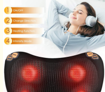
Enjoy Comfortable Massage Anywhere and Anytime