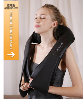
3D KNEADING MASSAGE SHAWL MASSAGE AND RELAX THE NECK AND SHOULDERS